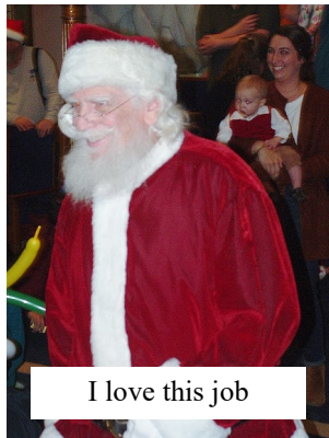
I love this job