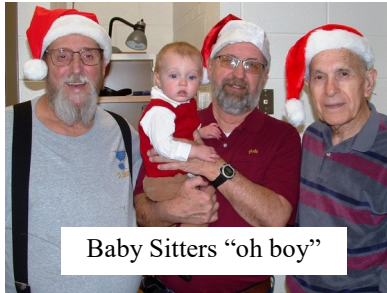
Baby Sitters "oh boy"