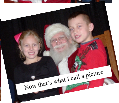
Now that's what I call a picture