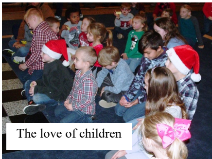
The love of children