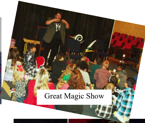
Great Magic Show