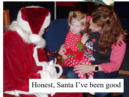
Honest, Santa I've been good