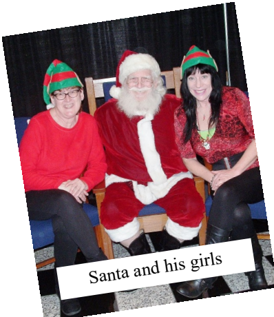
Santa and his girls

On Saturday, December 7, 2019 members of St. Louis Lodge No. 5 again held it's annual Children Christmas Party. This year, the party was held at the Rose Hill Masonic Temple. The children were not only treated to a Magic Show, but received snacks and drinks. The children then were visited by Santa Clause and received their own special gift from him.