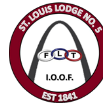
New Lodge Pin